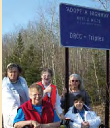
The Triplex Highway Crew.